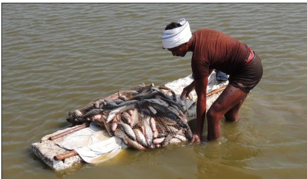
Commercial fishing in the Sagroli tank

The survey findings were supported with satellite data analysis. Three methods were used in GIS analysis to evaluate changes in vegetation and the water situation in a 2-km radius around the tanks.