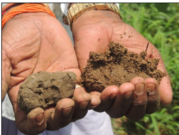
Visible change in soil structure after and before mixing with the tank silt

A special loan with ‘no/minimal’ interest rate may be offered to other farmers for transportation of the silt as the study found that they are often constrained as funds are not immediately available.